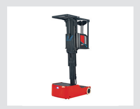
Optimized 1st and 2nd level order picking