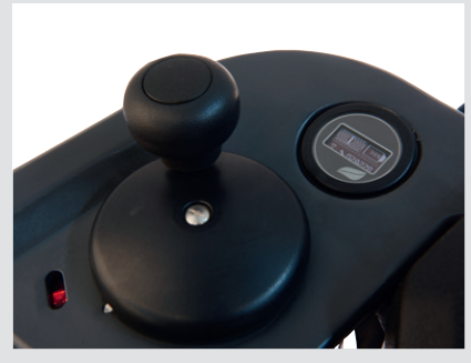
All information at a glance