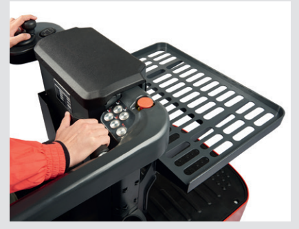
Spacious operator compartment